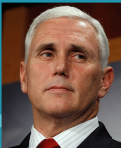
GOVERNOR Mike Pence